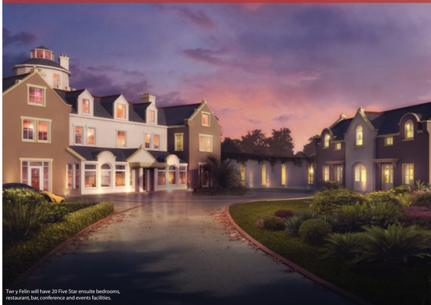
Twyr y Felin will have 20 Five Star ensuite bedrooms, restaurant, bar, conference and events facilities.

Set in the historic City of St. Davids and Pembrokeshire National Park, the refurbishment of an existing Grade II Listed Building, together with a new extension, provides a Five Star hotel with 20 bedrooms, function room, restaurant and supporting facilities. Currently Under Construction, the project requires exacting detailing and on-site co-ordination which will reopen in summer 2015.