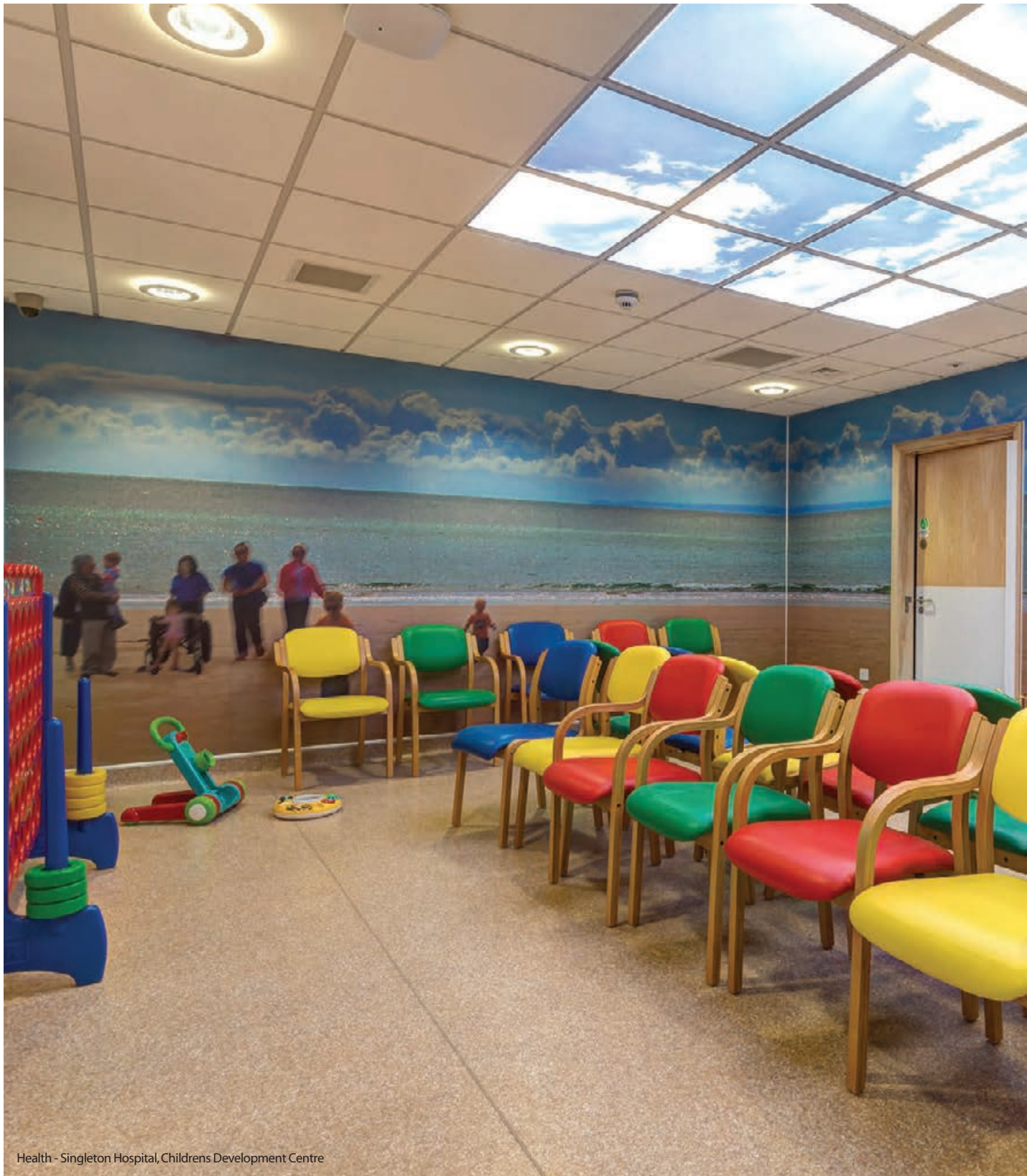
Health - Singleton Hospital, Childrens Development Centre